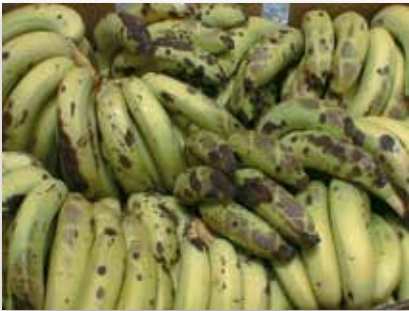
'Green ripe' fruits