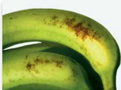
Red rust thrips