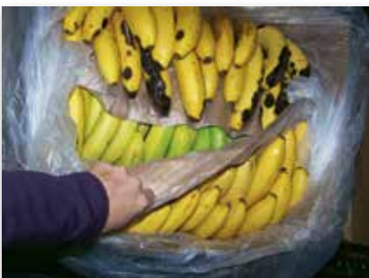
Latent anthracnose infection