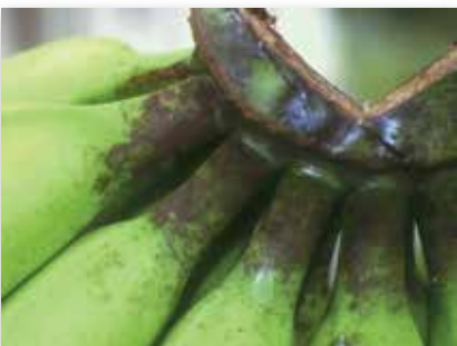
Sooty mould on fruit stalk