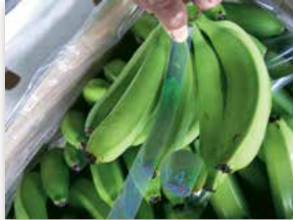
Fruit too short