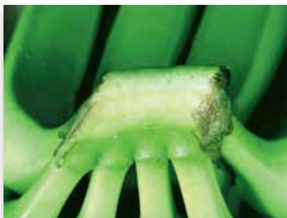
Crown cut too short