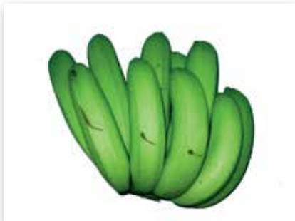
Scarring by guying cord