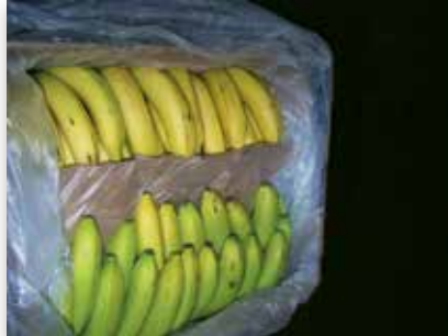
Unevenness after ripening