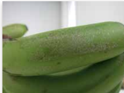
Silver rust thrips