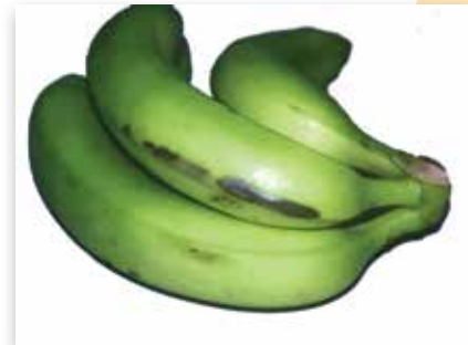
Bruising caused by impact during packing