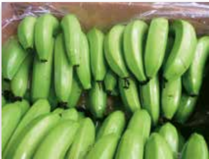
Incomplete flower removal