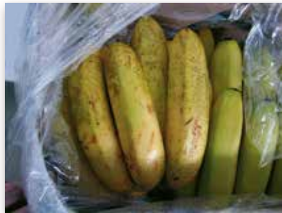
Red speckling at ripening