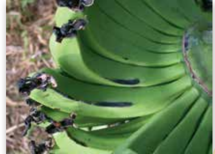
Scarring by a leaf