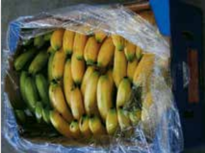
'Ship ripe' fruits