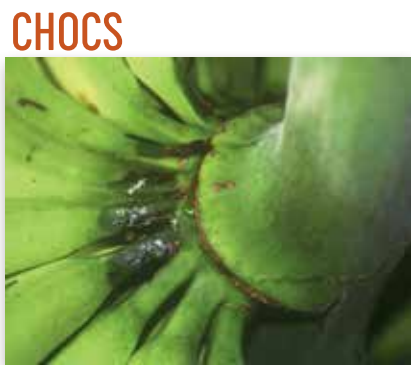
Flexed fruit stalks