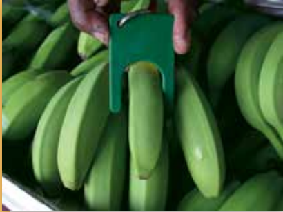
Fruit too thin