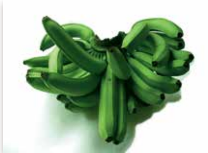
Double fruit and deformed fruit