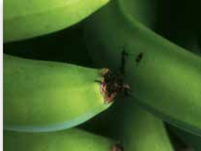
Scarring by a fruit tip