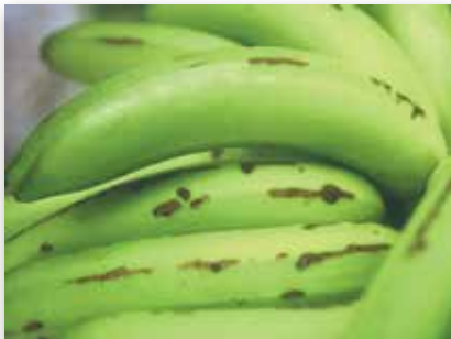
Damage by Diaprepes root weevil